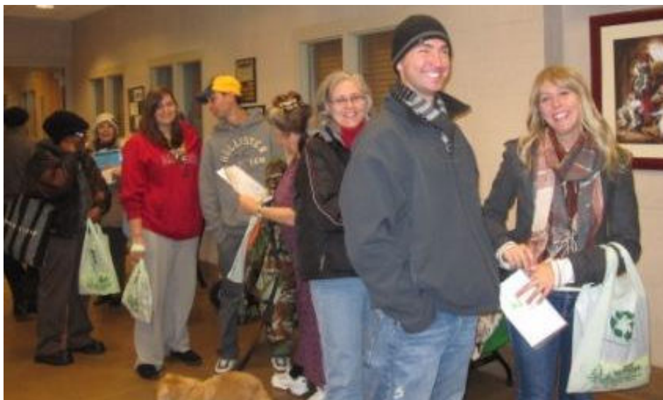
Dozens of people and animals waited patiently to go home with their new best friends.

Maybe it was the goodies, the reduced adoption fees, or just the presence of Santa, but everyone was on their best behavior!